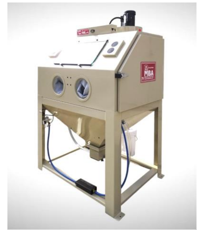
Shop Standard 2.0, 4836