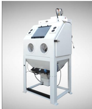
Shop Standard 2.0, 3628