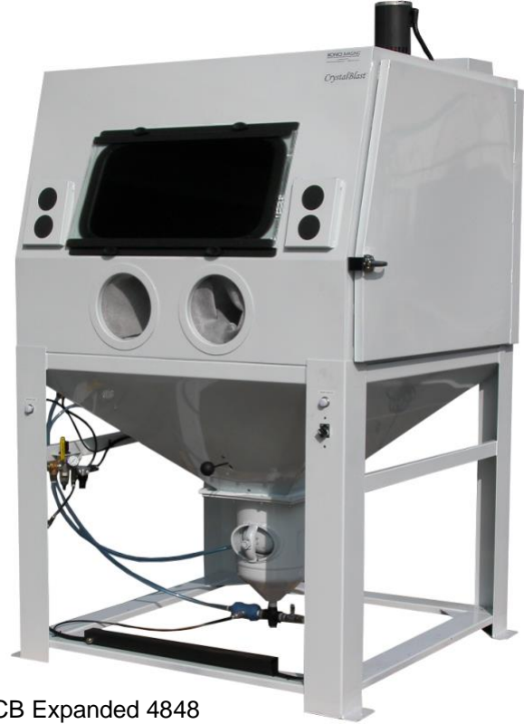
CB Expanded 4848