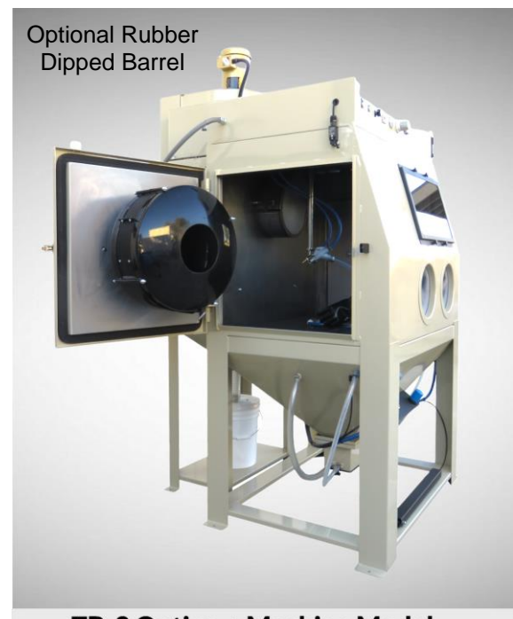
TB-2 Option + Machine Model = TB-2 Tumble Barrel Machine